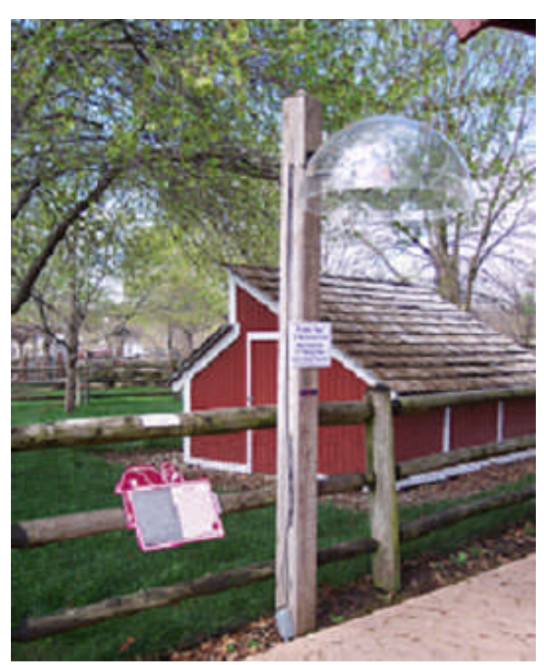
(Above) Another one of the Braille signs, this one posted beside an Audio Dome. (Opposite) An enlarged view of the sign that thanks OPHLC for providing the Audio Domes.