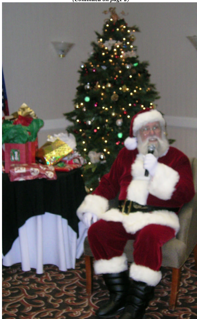
Santa visited us last year, as he has for the past few Yuletide seasons. Above, he greets the audience before he starts giving youngsters their special presents.