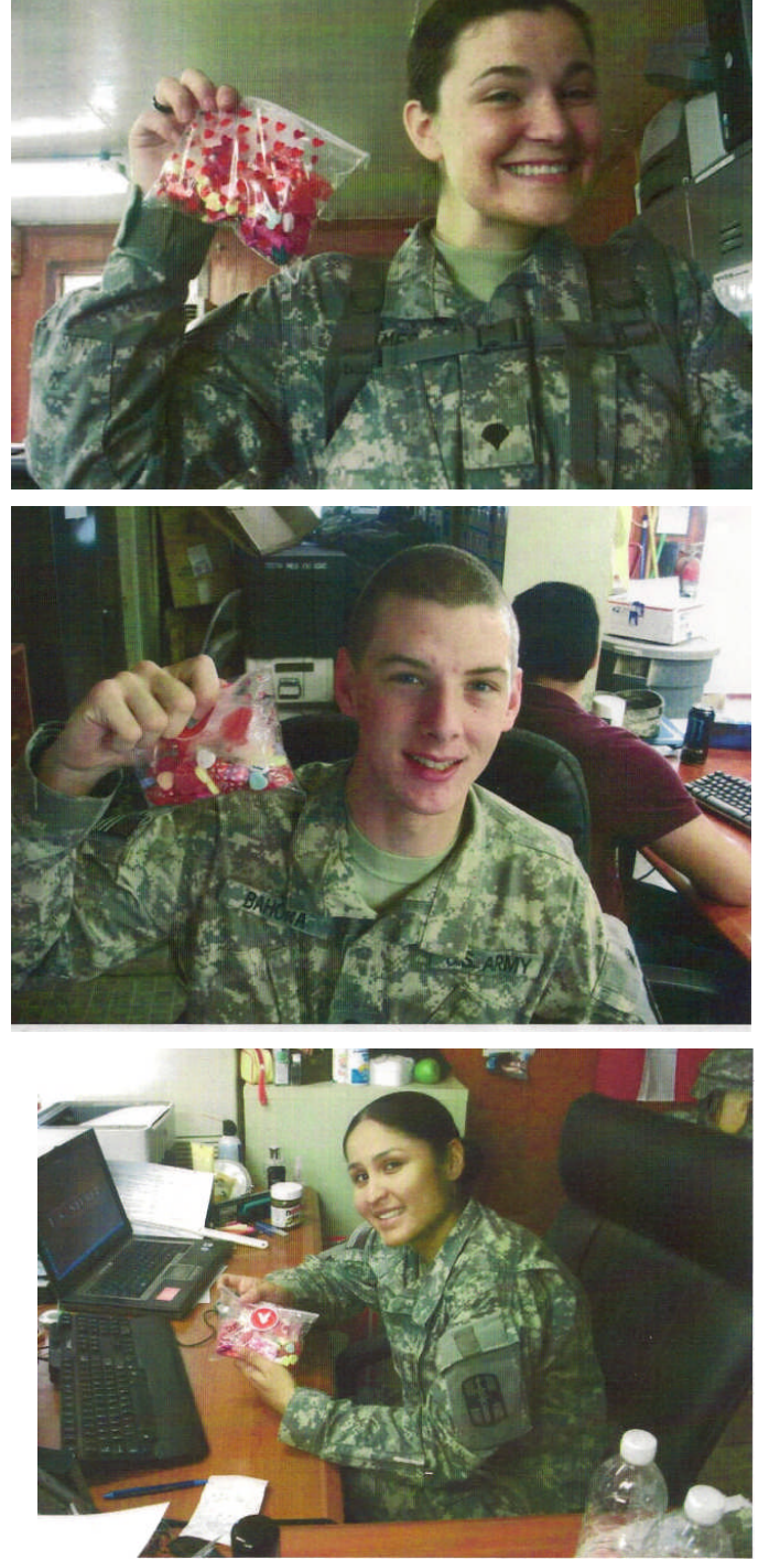
The soldiers pictured above are just a few of the 65 in the 1908th Medical Detachment, CSC in Iraq who received our Shoeboxes in late February. The smiles on their faces tell it all—they DO appreciate the support they get from those of us at home!