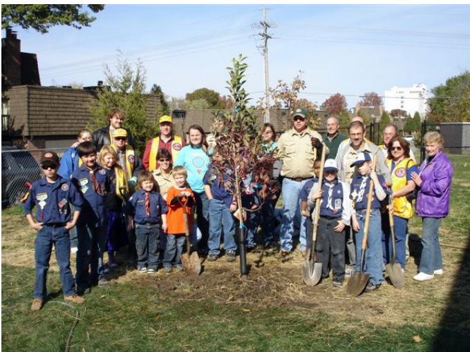
International Presidents' Project