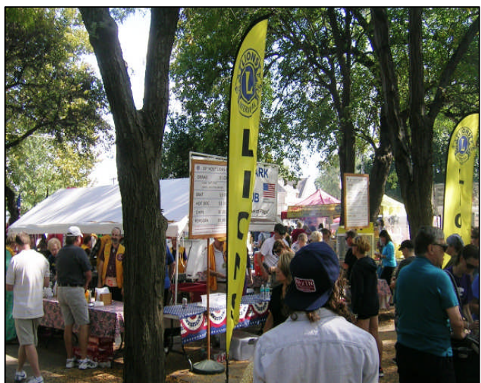
Above is typical activity around our food booth at the Downtown Overland Park Fall Festival on September 27. Beautiful weather and enthusiastic crowds throughout the day helped "stoke" our Activity Fund by almost $5,000.