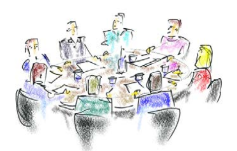
(Cartoon is "borrowed" from the Internet)